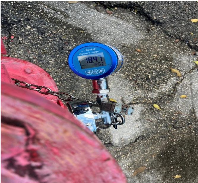
FIRE HYDRANT# 2 STATIC PREASSURE: 78.5 PSI