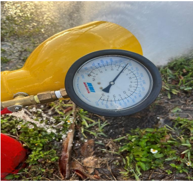
FIRE HYDRANT# 1 FLOW GPM: 1,255GPM