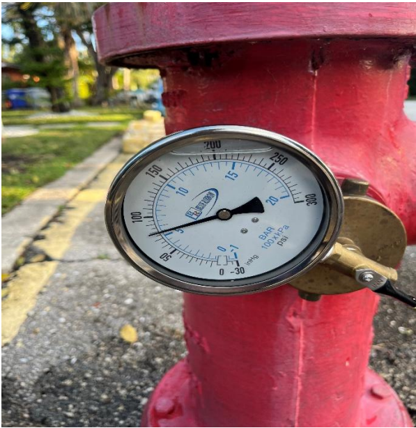
FIRE HYDRANT# 2 DURING FLOW RESIDUAL PREASSURE: 75 PSI